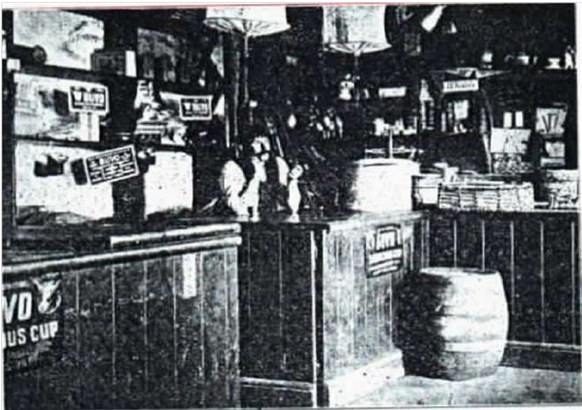
Lundy Island Shop.