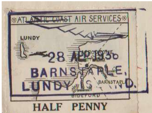
The full cancel, type Cb, showing the frame, winged motif, date and the words 'BARNSTAPLE, LUNDY ISLAND'

The 1936-38 'Winged Motif' cancel in its various forms was in service between 25 th March 1936 and 10 th November 1938, although the official date of introduction was 31 st March 1936.