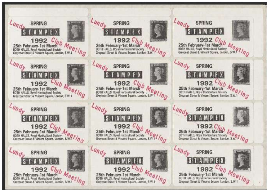
A sheet of twelve overprinted Stampex publicity labels (D. Boyd display)

The exhibition displays available to view online were also of a very high standard, covering a wide variety of philatelic subjects. Of particular interest to members was an exhibit by David Boyd (a non-LCC member) featuring material connected with Lundy Collectors' Club meetings and exhibitions. The display examined items such as ephemera, publicity labels, souvenir sheets and stamp booklets associated with the club. As the exhibitor noted, such material can often be difficult to obtain and may command high prices when it appears on the market, making the collection both unusual and historically informative.