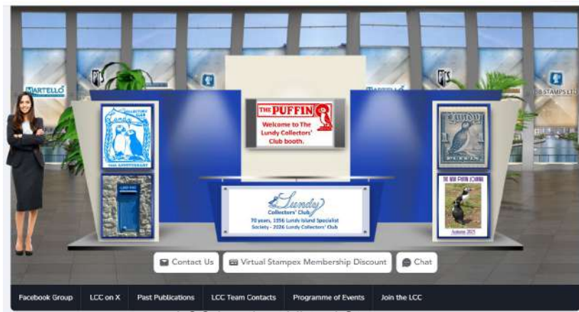
LCC booth at Virtual Stampex

Encouragingly, analytics from the booth also showed that a number of visitors followed links through to the Lundy Collectors' Club website and Facebook page, helping to broaden awareness of the club and its activities. This demonstrates the value of maintaining an active online presence and highlights the effectiveness of events such as Virtual Stampex in promoting specialist societies to a wider audience.