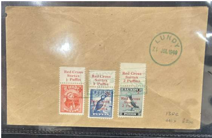
One of the Red Cross overprint covers