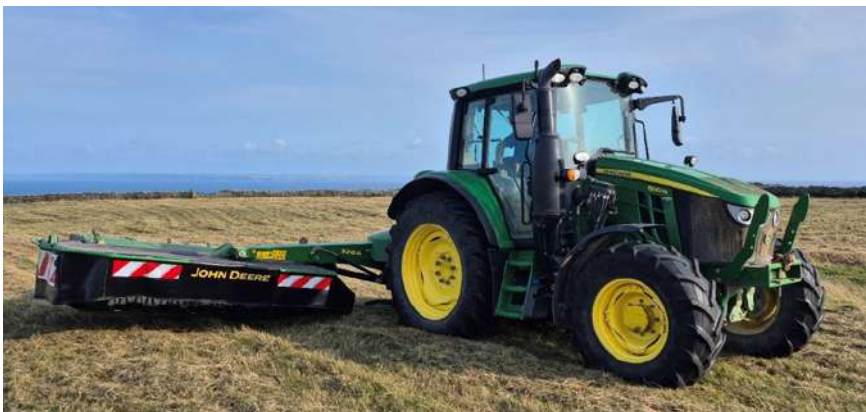
Tom cutting winter silage with the new mower

With help from our Royal Marine friends at Instow, we've replaced the farm tractor and mower. We've also replaced the mainland crew minibus after a series of mechanical problems and advice from our garage.