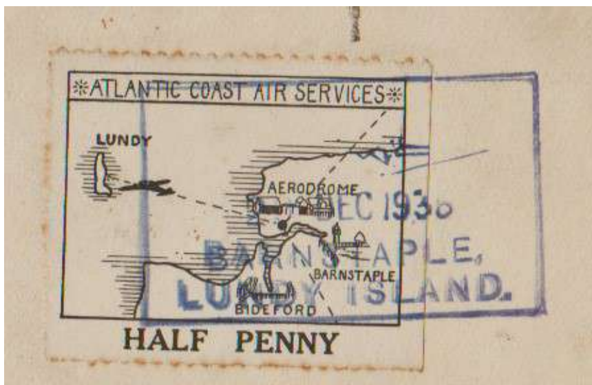
Type Cba (perhaps!) showing a small faint part of the winged motif

Jon states that only four examples of type Cba are known to exist which makes me believe that type Cba is in fact type Cb that were not fully inked and the example shown above shows that the motif was present but only a small part received ink.