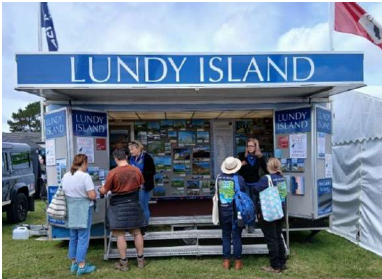
Lyndsey and Tracey at the Royal Cornwall Show

The team flew the Lundy flag at the Royal Cornwall show in June and attended several other regional shows spreading the word.