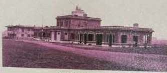
BRUSSELS AIRFIELD 1936